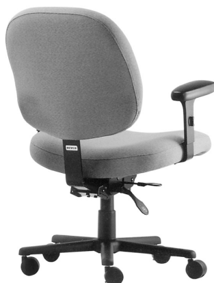
Model 10,000 with optional armrests and gel arm pads

Made in the USA, all models of the BEVCO 10,000 Series are backed by a 3-year comprehensive warranty and include a lifetime guarantee on the cylinder. The warranty covers all defects in material and workmanship and is not prorated. All 10,000 Series chairs meet or exceed BIFMA standards and are ADA compliant.