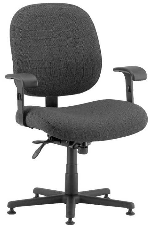
Model 10,000 Industrial with optional armrest and polyurethane arm pads