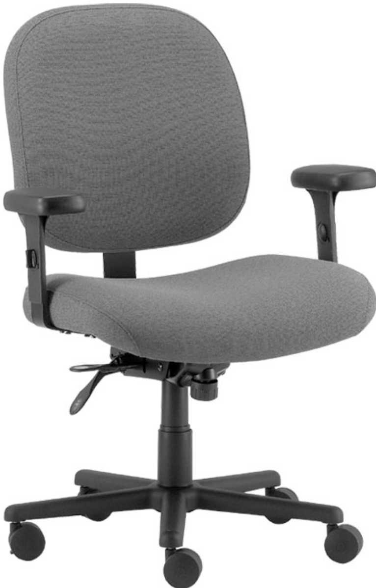
Model 10,000 Office with optional armrest and gel arm pads